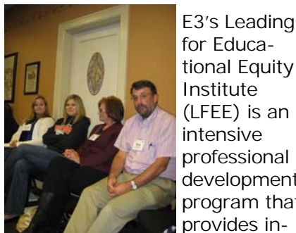
Prepping for Diversity Rounds